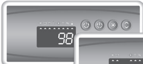
Two pump system