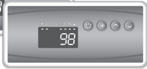
Single pump system

The Quick Reference Card provides a quick overview of your spa's main functions and the operations accessible with your digital control pad.